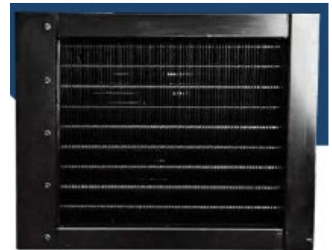
HIGH AIR CAPACITY OF 1.600 m 3 /hr