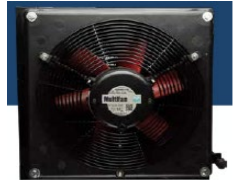
ROBUST A-CLASS QUALITY FAN