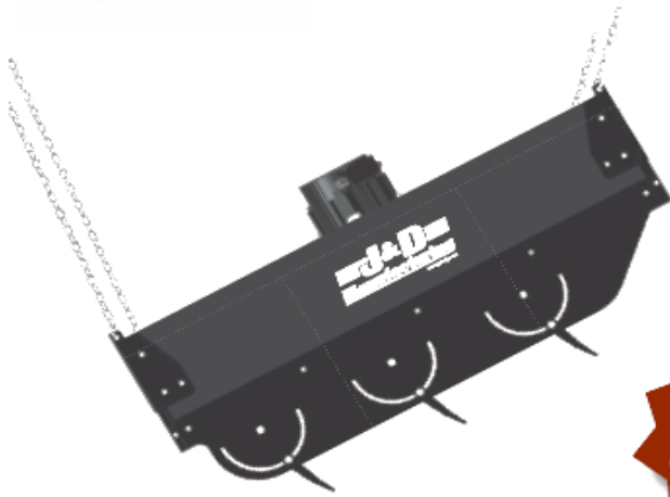
3 Louver Uni-Directional