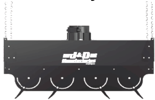
4 Louver Bi-Directional