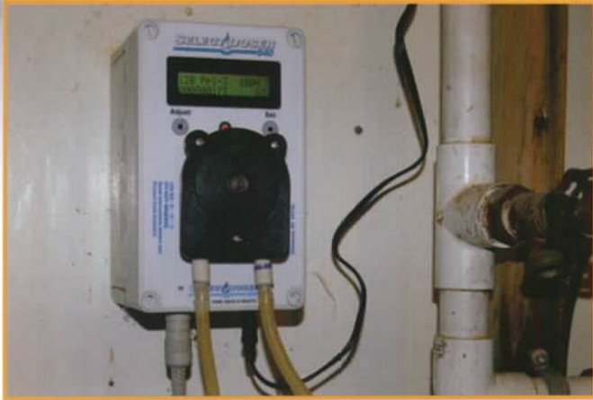
The SelectDoser 640 is wall-mounted and connected to a nearby water line and power supply.