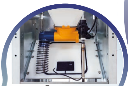
Easy access to the motor and water valve