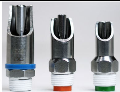
ADAPTIVE FLOW "BITE" DRINKER NIPPLES