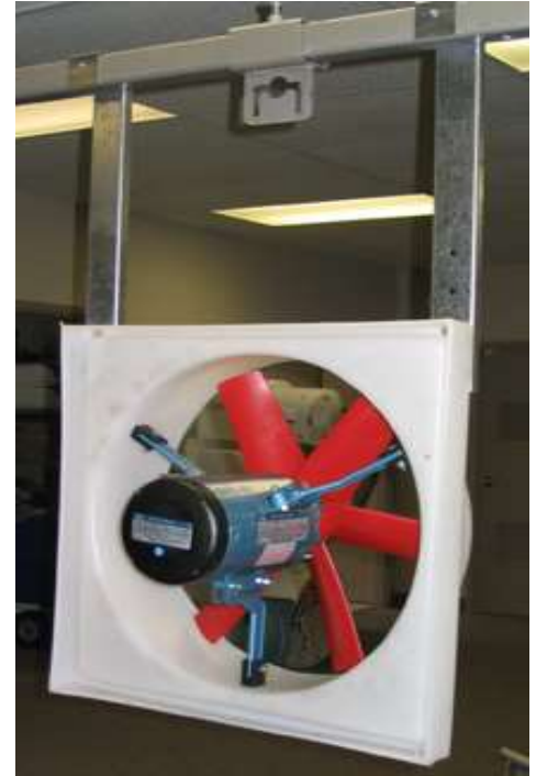
The above picture is shown with the galv. hanger bracket set

Designed for long life and effective air circulation Equipped with LEESON Performa Plus Motor Two Year Warranty Automatic Thermal Protection Dual voltage motor, can be operated variable or one speed Available with & without wire guard NOTE: Must be hung 2.5 meters above floor or grade level