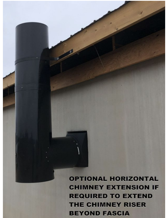
OPTIONAL HORIZONTAL CHIMNEY EXTENSION IF REQUIRED TO EXTEND THE CHIMNEY RISER BEYOND FASCIA